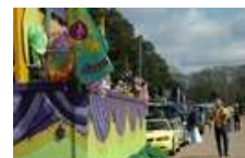
Alexandria Mardi Gras Parade